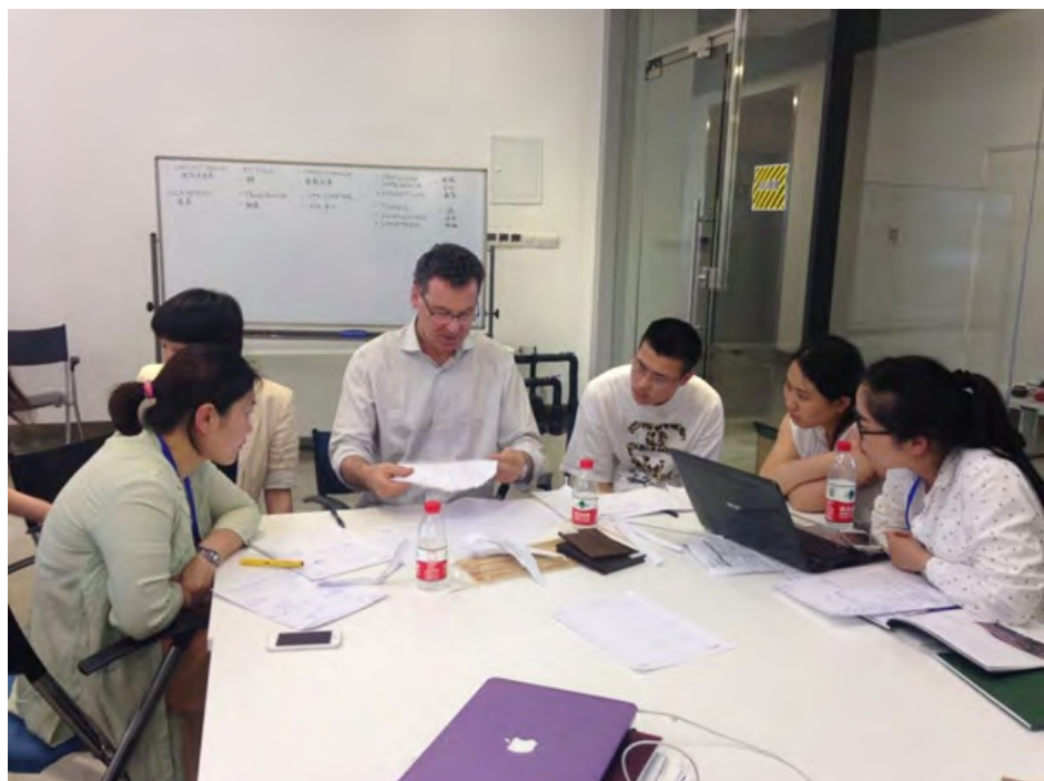
Group discussion at the workshop

The workshop lasted for three days and focused on modern, green, hi-tech bamboo architecture. Students came from universities across China, including architecture postgraduates from Shanghai University, Tongji University, Shanghai Normal University, East China University of Science and Technology, and Soochow University. Professional architectural designers with over 10 years of practice also joined the workshop to gain further insight on the developing trend.